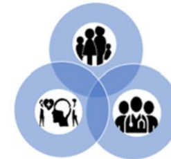
Regional Behavioral Health Hubs

FPMHC aims to improve mental health access for children and adolescents by expanding primary care provider capacity and effectively integrating behavioral health services through consultation, coordinated care, or colocation based on regional needs.